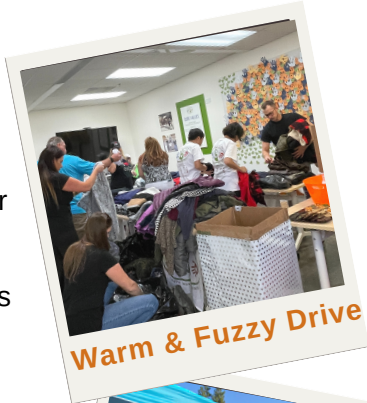
Warm & Fuzzy Drive