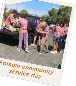
Folsom community service day