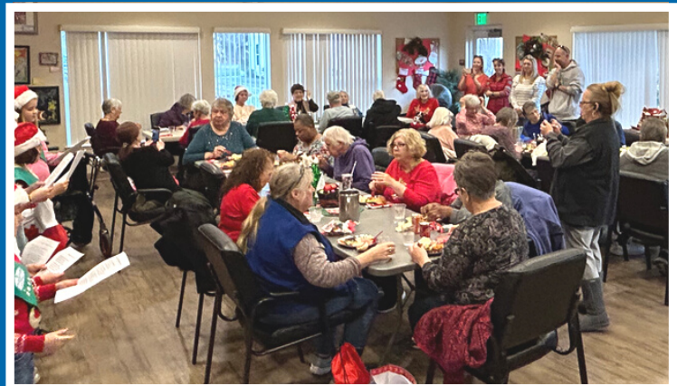
In its 10th year, Hands4Hope's monthly Mercy Creekview Senior Dinner is back to in person dining providing a warm meal, entertainment, and most important companionship to 30-50 seniors.

"The lessons that happen at the Mercy Senior Dinner Outreach...I realize them when we are in the car and the kids give a download of the event from their eyes...so, so powerful and it hits their hearts more than I could ever teach them or tell them myself...thank you for providing opportunities for youth to help give back."