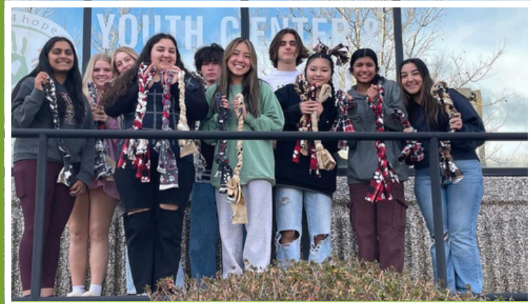
Folsom High youth participate in a club team build at the Hands4Hope Youth Center.