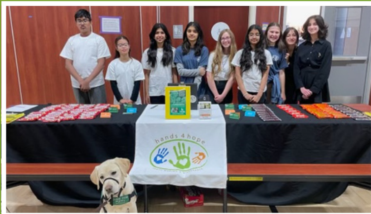
Sutter Middle Hands4Hope Club Participants, joined by Houdini, raise funds for Guide Dogs for The Blind by hosting a snack bar at a school event.

"Hands4Hope - Youth Making A Difference has helped me become a well-rounded person. It has really helped increase my confidence while speaking to my peers, time management and working with others. I have also had many opportunities to grow as a leader."