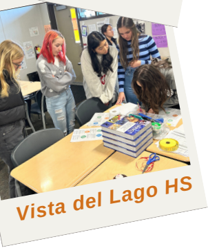
Vista del Lago HS