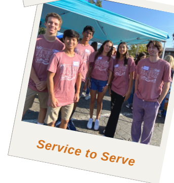
Service to Serve