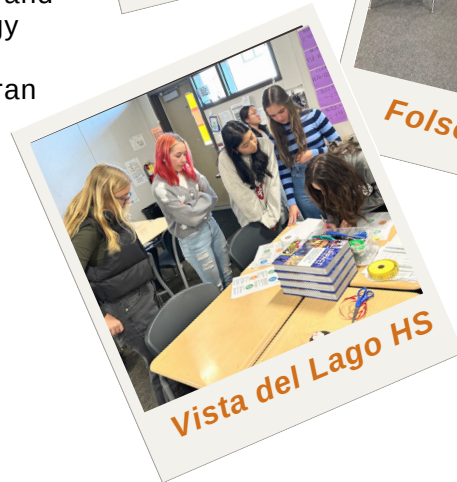
Vista del Lago HS